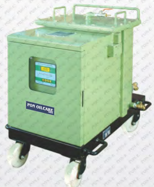
Pon OilCare System - PON100