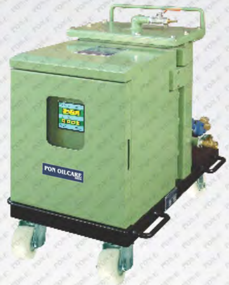
Pon OilCare System - PON25