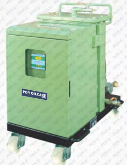
Pon OilCare System - PON50