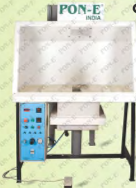
GUNLESS COATING SYSTEM